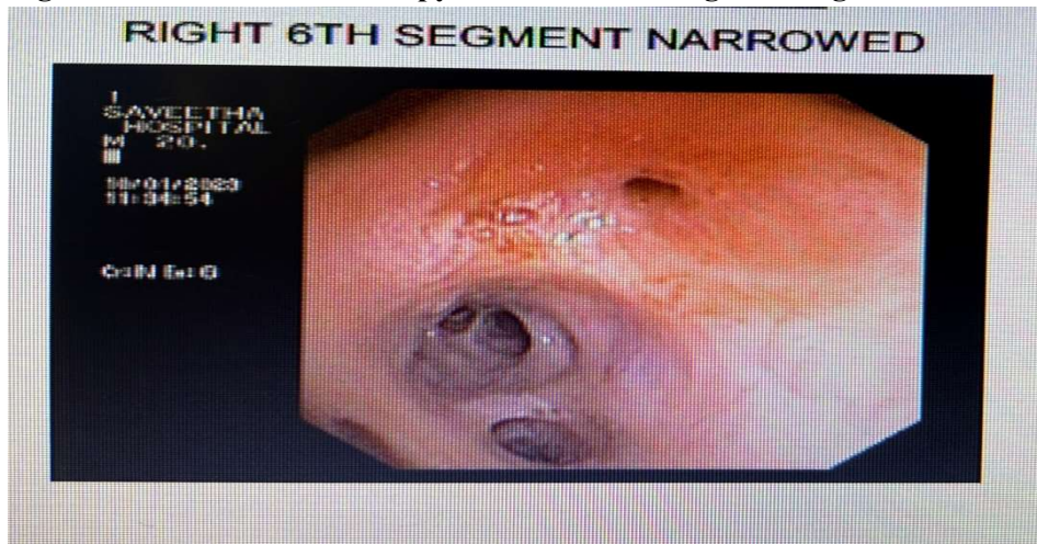
Figure-4: Flexible bronchoscopy examination of Narrow right lower lobe.