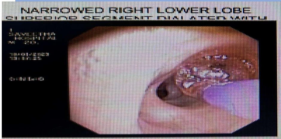
Figure-5: Flexible bronchoscopy examination of Dilated right lower lobe.